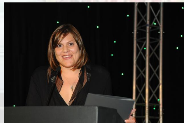
The guest speaker of the event Natalie du Toit , who, on the 4 th of November, was named Sportswoman of the Year with a Disability at the 2012 South African Sports Awards